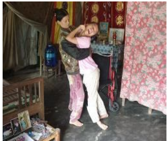
Her mother is leading by hand on her wheelchair