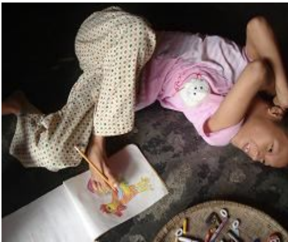
Thanh is drawing her picture